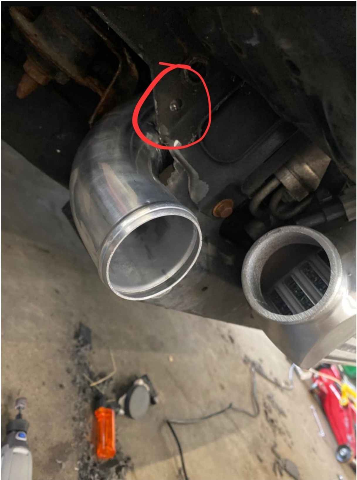
10. The position of the long pipe that goes to the turbocharger is shown here. To make it easier to attach and fasten the silicone connector, remove the headlight (passenger side)